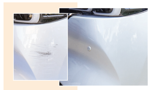
Bumper Bar Scrapes & Scratches