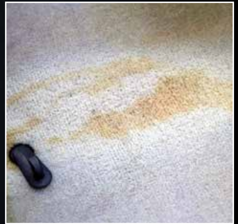
Interior Surface Stains