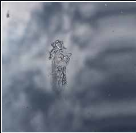
Bat Droppings Stains